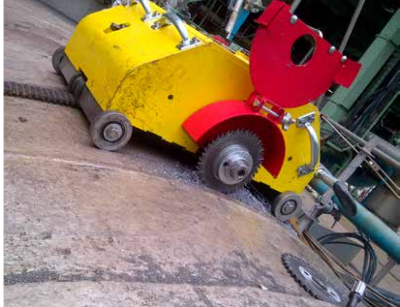
Cold cutting of large diameters.